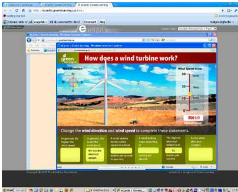
Figure 2. Screen capture of the interactive wind turbine.

use new interactive materials such as a wind turbine which can be launched from the home page. Using the game-like interactive device, the students are familiarized with the parts of the turbine, they can experience with the impact of wind direction and speed, and measure electrical output. Figure 2 represents a screen capture taken from the home page of the eCards video tour where the learning activity facilitated by the interactive wind turbine is demonstrated for viewers.