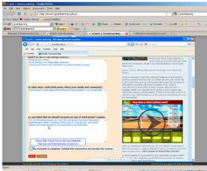
Figure 3. Screen capture of questions and answers from the home page of the eCards video tour