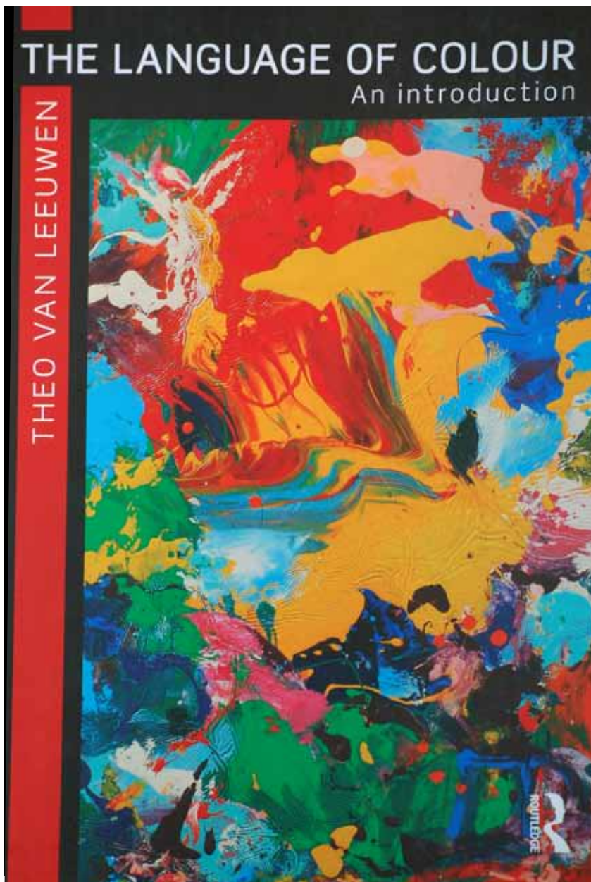
Theo van Leeuwen The language of colour. An introduction.