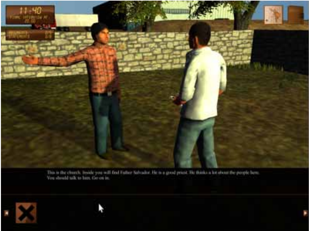
Figure 2. Screenshot from Global Conflicts: Maquiladores

and hours on end. Furthermore, the game website also includes a web editor, where students may write and publish articles based upon their experience of playing the game.